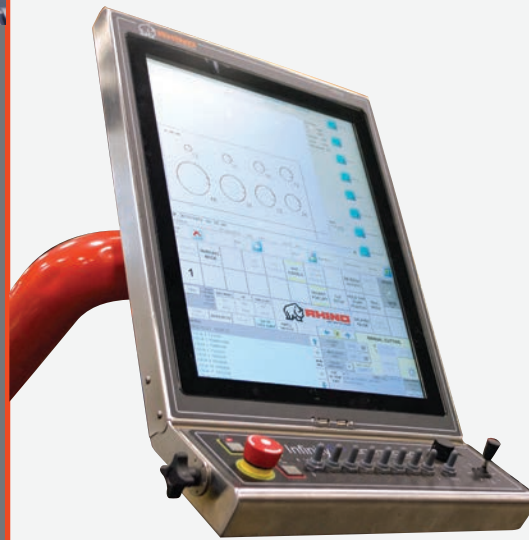
Infinity Touchscreen Operator Console