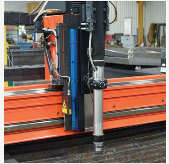
Linatrol high speed torch lifter.